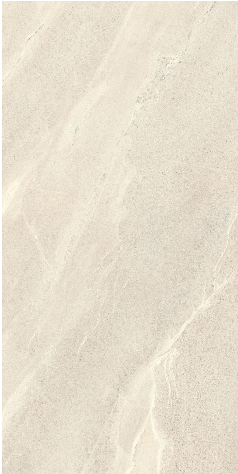
30 x 60 cm (12 x 24) VE.LF.BIA.1224.MT