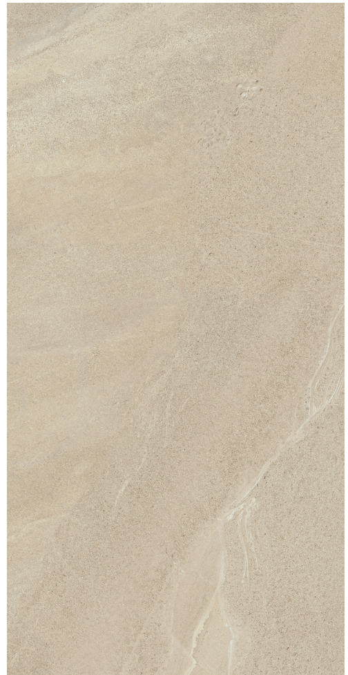
30 x 60 cm (12 x 24) VE.LF.BGE.1224.MT

All items shown in this document are part of Olympia's stocking program. For special orders, please contact your Olympia Tile Sales Representative.