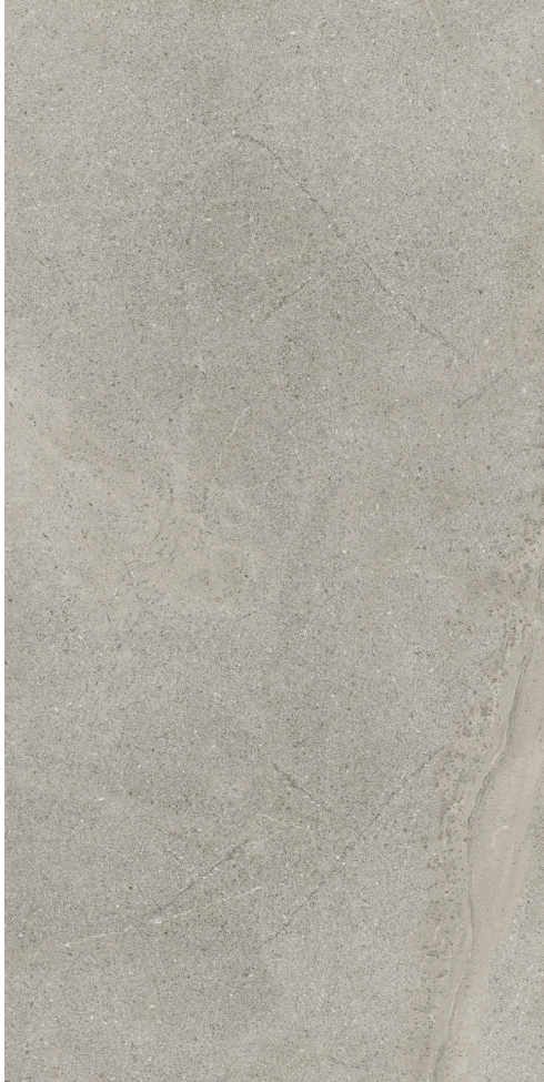
30 x 60 cm (12 x 24) VE.LF.GRY.1224.MT