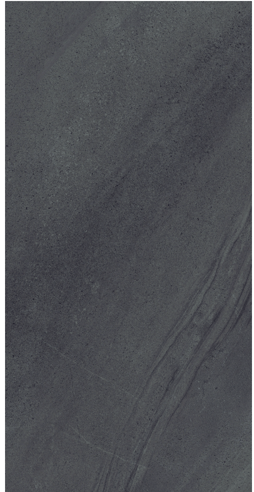
30 x 60 cm (12 x 24) VE.LF.ATR.1224.MT

All items shown in this document are part of Olympia's stocking program. For special orders, please contact your Olympia Tile Sales Representative.